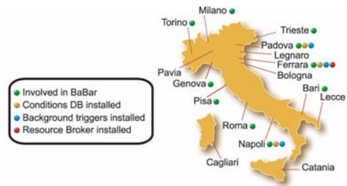
Fig. 1: Resources available for BaBar SP on the Italian Grid.

Three sites (Ferrara, Padova, Naples) were configured to provide Objectivity and Xrootd services that could be accessed from the Grid Worker Nodes over the WAN using AMS and the Xrootd protocol. The typical amount of conditions data read by a single simulation job was about 2% of the total and the use of the WAN reduced the CPU efficiency by about 5%, which was acceptable.